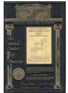
United States Patent No. 5,973,595